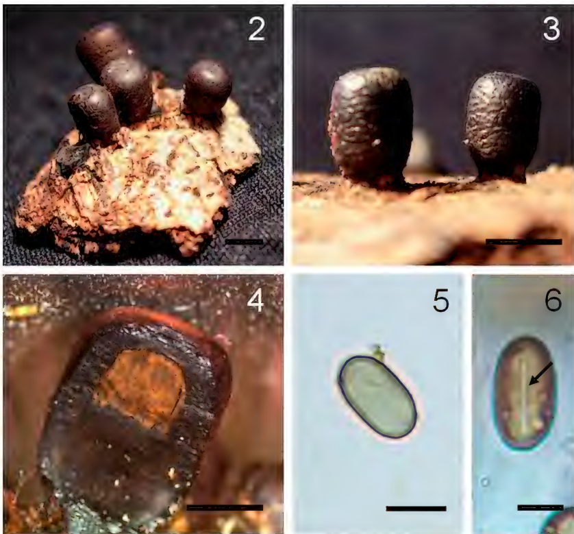
FIGS 2–6. Phylacia cylindrica (holotype, CEPEC 2388). 2. Stromata. 3. Stromata showing constricted base. 4. Cross section showing inside of the stroma. 5. Sub-cylindrical ascospore without apparent germ slit. Phylacia surinamensis (holotype, K[M] 196019). 6. Ascospore with conspicuous germ slit. Bars: 2, 3 = 5 mm; 4 = 3 mm; 5, 6 = 5 μm.

Stromata solitary or gregarious, erumpent through bark, cylindrical, dark brown to black, 4–5 × 2–5 mm, surface smooth, carbonaceous, sessile or stipitate, base constricted, apex flat to slightly concave. KOH-extractable pigments purple vinaceous. Perithecia cylindrical, 2.5 × 0.4–0.5 mm, numerous. Asci not seen. Ascospores elliptical to sub-cylindrical, pale olive, 9.5–12.5 × 6–9.5 μm, smooth, without apparent germ slit. Perispore indehiscent in 10% KOH.